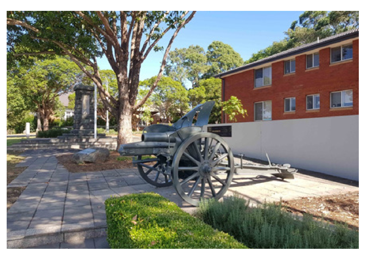
Image: Completion of the Howitzer Gun Project at Merrylands Rememberance Park