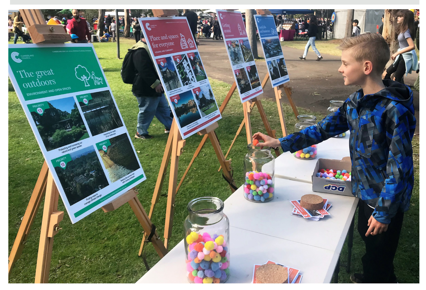
Image: Community engagement during the development of the new Strategic Planning Framework