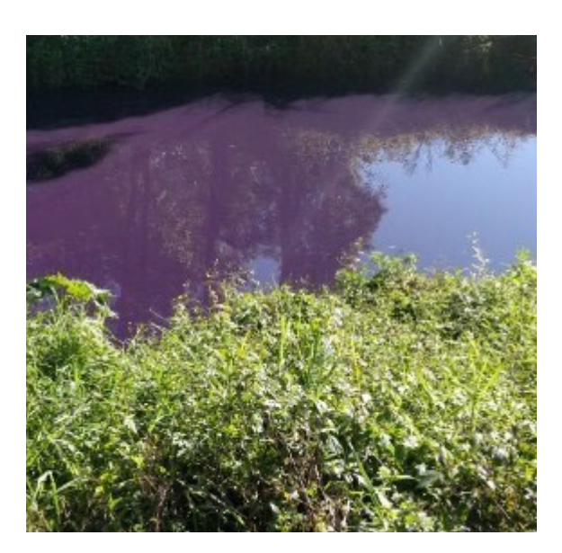
Images: Examples of pollution incidents during Q4 that were attended by Council regulatory officers.