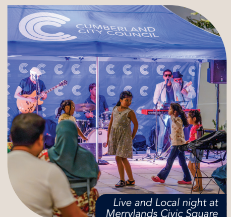
Live and Local night at Merrylands Civic Square