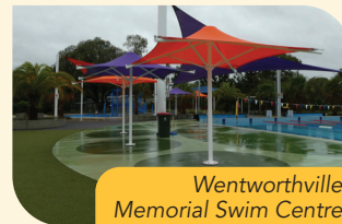
Wentworthville Memorial Swim Centre

Council has completed the installation of new shade sails and outdoor umbrellas at Wentworthville Memorial Swim Centre. The sails will provide sun protection for children and families and will help create a more enjoyable environment for residents, families and visitors to the pool.