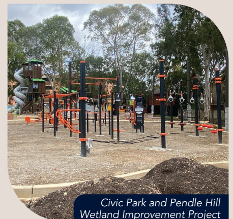
Civic Park and Pendle Hill Wetland Improvement Project