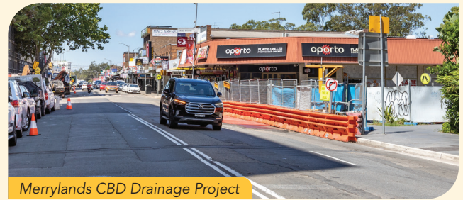
Merrylands CBD Drainage Project

https://haveyoursay.cumberland.nsw.gov.au/merrylands-cbd-upgrades