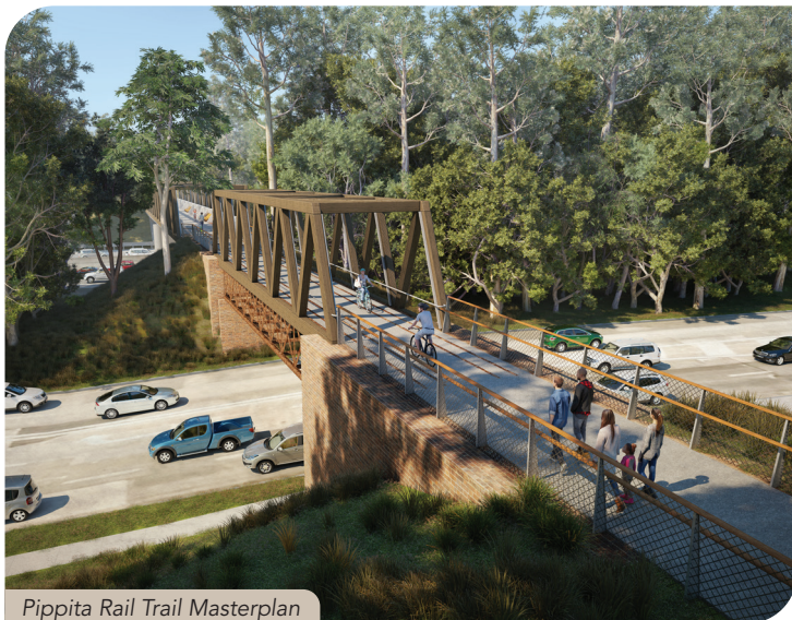
Pippita Rail Trail Masterplan

It once serviced the State Abattoirs, State Brick Works and Homebush Saleyards with stations including Pippita, Metropolitan Meat Platforms, Abattoirs and Brickworks.