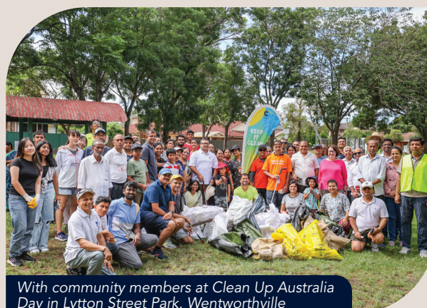
With community members at Clean Up Australia Day in Lytton Street Park, Wentworthville