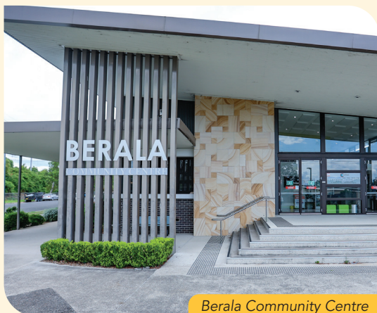
Berala Community Centre

www.cumberland.nsw.gov.au/community-centre-programs