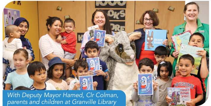
With Deputy Mayor Hamed, Cllr Colman, parents and children at Granville Library

To participate, parents can easily register online or visit any library in the Cumberland Local Government Area. Once registered, participants can pick up a FREE starter pack, which includes a reading log to track their progress. As part of the program, children will receive small gifts to celebrate their milestones.