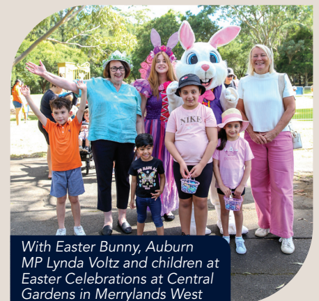
With Easter Bunny, Auburn MP Lynda Voltz and children at Easter Celebrations at Central Gardens in Merrylands West