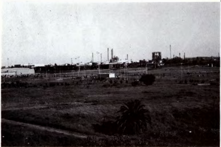
Open space and playing fields-Wilson Park.