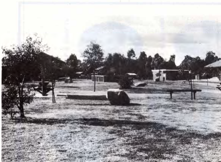
Picnic area - Botanical Gardens.