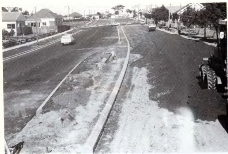
Roadworks - Bede Street Lidcombe.