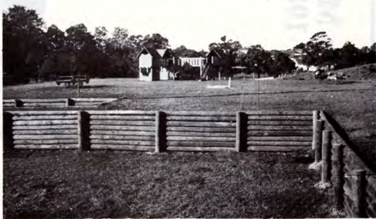
Playing Equipment - Wyatt Park.