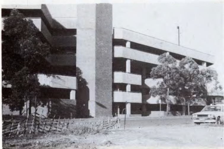
Parking Station - Lidcombe.