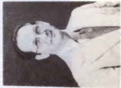
Deputy Mayor: Ald. B. ...