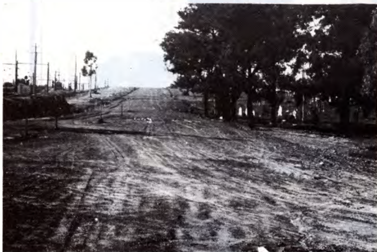
Roadway Through Cemetery Construction.