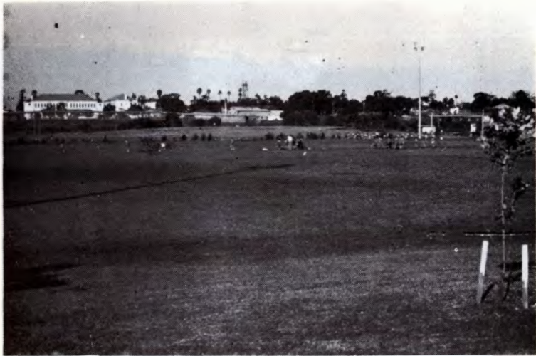
Playing fields and barbecue picnic area-Wilson Park.