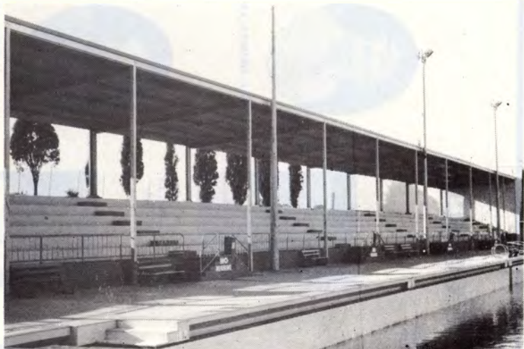
Granstand Cover — Swimming Centre.