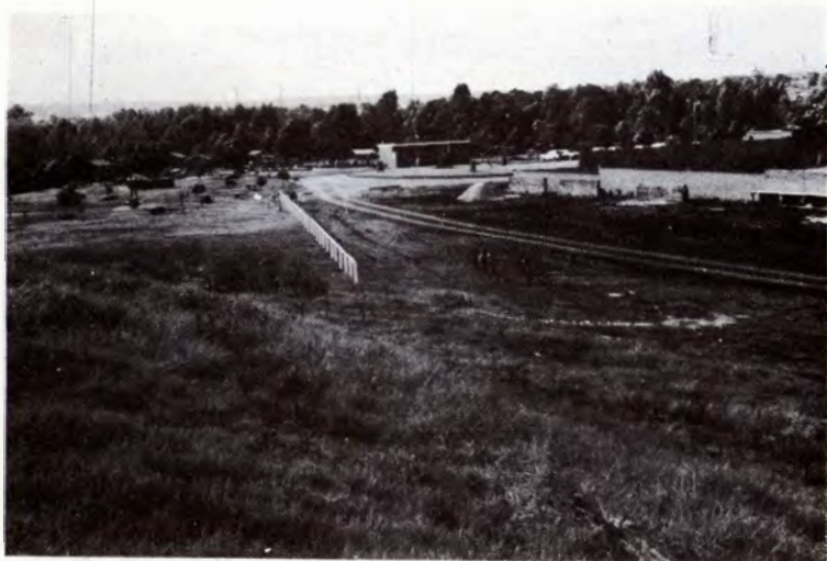
Construction of additional amenities - Botanical Gardens.