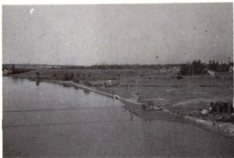
Parramatta River Foreshore parklands.