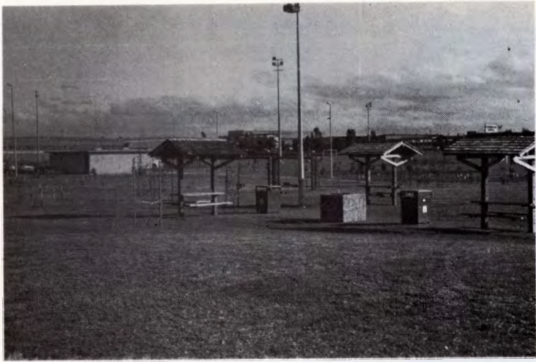
Barbecue picnic area - Wilson Park