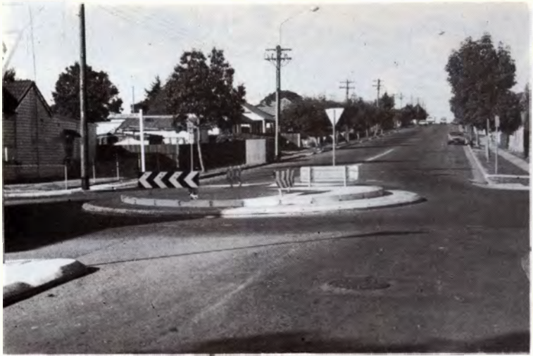
Roundabout Cnr Chiswick and Cumberland Roads.